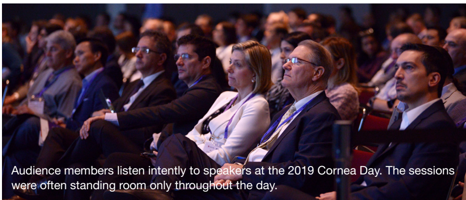
Audience members listen intently to speakers at the 2019 Cornea Day. The sessions were often standing room only throughout the day.

The algorithm begins with the preoperative visit, and the first step is noninvasive refractive surgical planning tests. The second step is an OSD screen, looking at symptoms and signs. Step 3 is