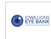
Iowa Lions Eye Bank