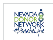
Nevada Donor Network