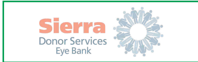
Sierra Donor Services Eye Bank

We would like to thank all the sponsors who make this event possible: